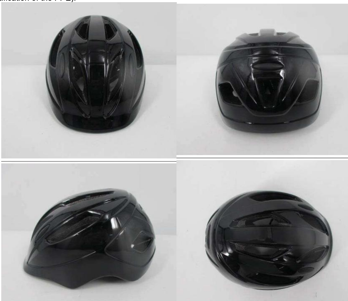
.....[Insert identification information or photo].....